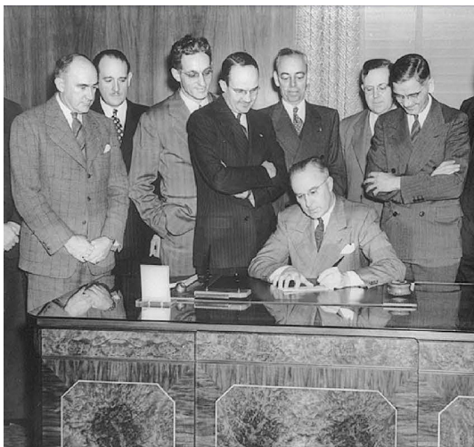
Oregon Gov. Earl W. Snell signs legislation creating the Public Employees Retirement System on March 26, 1945.

Within a silent panic Consuming my thoughts A certain hope Dare I peek